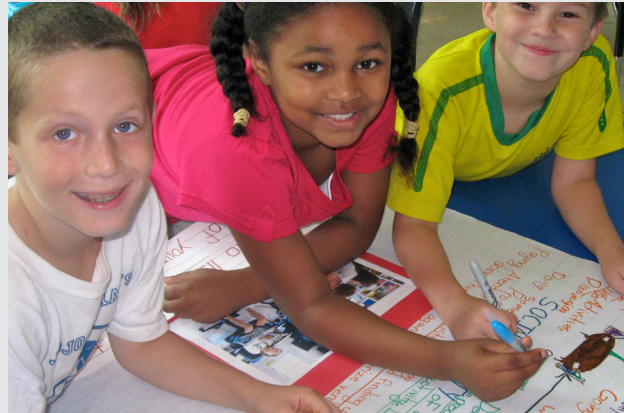
Students and families regularly reflect on how they embody the EL design principles.

While Clairemont’s performance on state tests has been strong and consistent for many years, what truly distinguishes the school is its sense of community, marked by respect, responsibility, and joy in learning. The EL design principles provide a blueprint for building a positive school culture and encouraging students to challenge themselves and take responsibility for their learning. In morning meetings and community meetings, students reflect on how they embody design principles such as Service and Compassion and The Having of Wonderful Ideas . One student reflected, “I feel joyful because it teaches me how to be nice and be together.” In a true show of support for the school, Clairemont parents began a recent PTA meeting by discussing EL’s ten design principles and what they mean to their families.